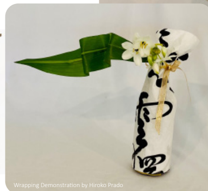
Wrapping Demonstration by Hiroko Prado