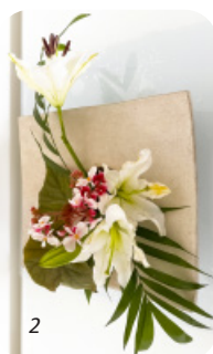
1 - Masae Ako, 2 - Paulina, 3 - May Wong, 4 - Alexander Evans

These arrangements have been shared by members for your enjoyment. If you'd like to submit a photograph please email your picture to: sogetsu.ikebana.nsw@gmail.com